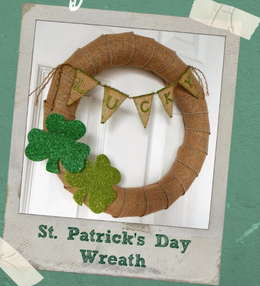
St. Patrick's Day Wreath